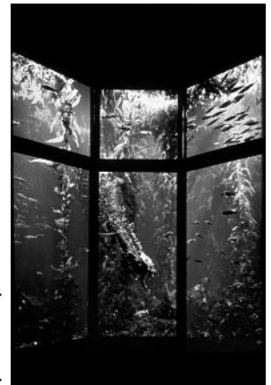
Kelp forest exhibit at the Monterey Aquarium

As you stroll through the Aquarium, tour guides will be available to answer any questions you may have about the sea life. As a special feature, you will be able to view a 20-minute presentation of divers feeding the fish in the Kelp Forest Exhibit. Conclude your evening by dancing the night away to "music from around the world" under a gallery of life-sized replicas of whales and dolphins. This will be a most unforgettable experience and should not be missed.