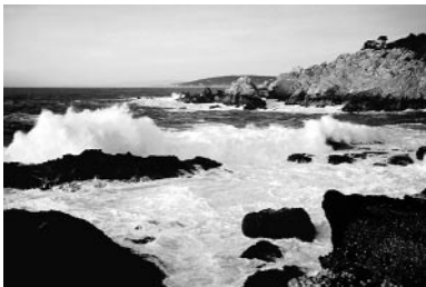
Waves Crashing off Big Sur

If you are interested in a scenic drive, head south on Highway 1 towards Big Sur where you will witness an amazing coastline of crashing waves against huge rock formations. On your way to Big Sur, stop at Point Sur Lightstation which has been and remains in operation for over a century. Point Lobos, just outside Carmel, is another pleasant place to visit. Robert Louis Stevenson was inspired by Point Lobos when he wrote the classic book Treasure Island . Another scenic drive is 17-mile drive where one can stop at the various points, including Pebble Beach Golf Course ; you can end your drive at the Carmel Mission to experience what mission life was like and view California's first library.