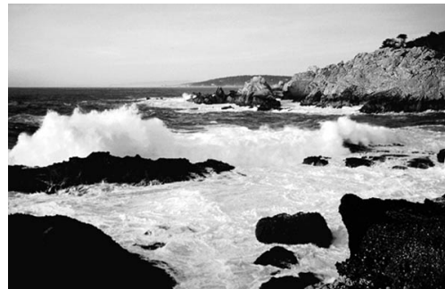
Waves Crashing off Big Sur