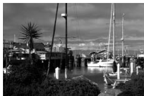
The Monterey Harbor and Marina, provides access to a number of recreational and commercial venues for both visitors as well as residents

A treasury of fabulous scenery and hiking await visitors at destinations such as Carmel Beach (below) and the Pacific Grove Coastline (lower right)